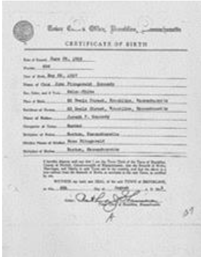
Birth certificate for John F. Kennedy