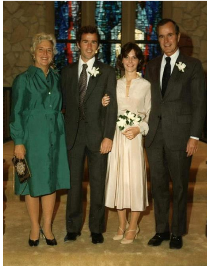
President George H.W. Bush, First Lady Barbara Bush, President George W. Bush, and First Lady Laura Bush