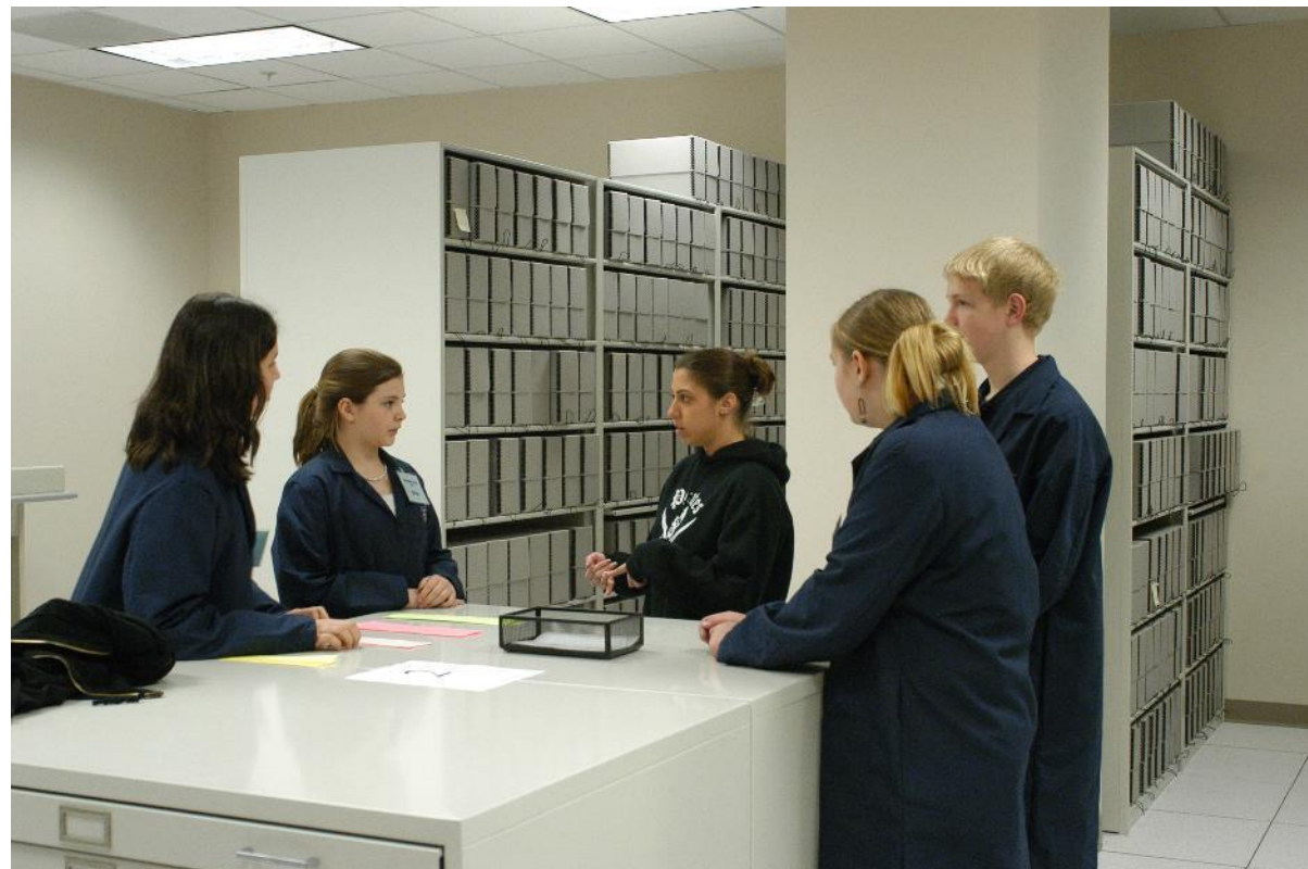
Reproduction of the stacks in the Boeing Learning Center