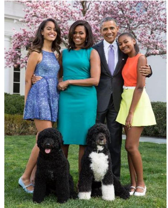
President Barack Obama, First Lady Michelle Obama, their daughters Malia and Sasha, and their dogs, Bo and Sunny