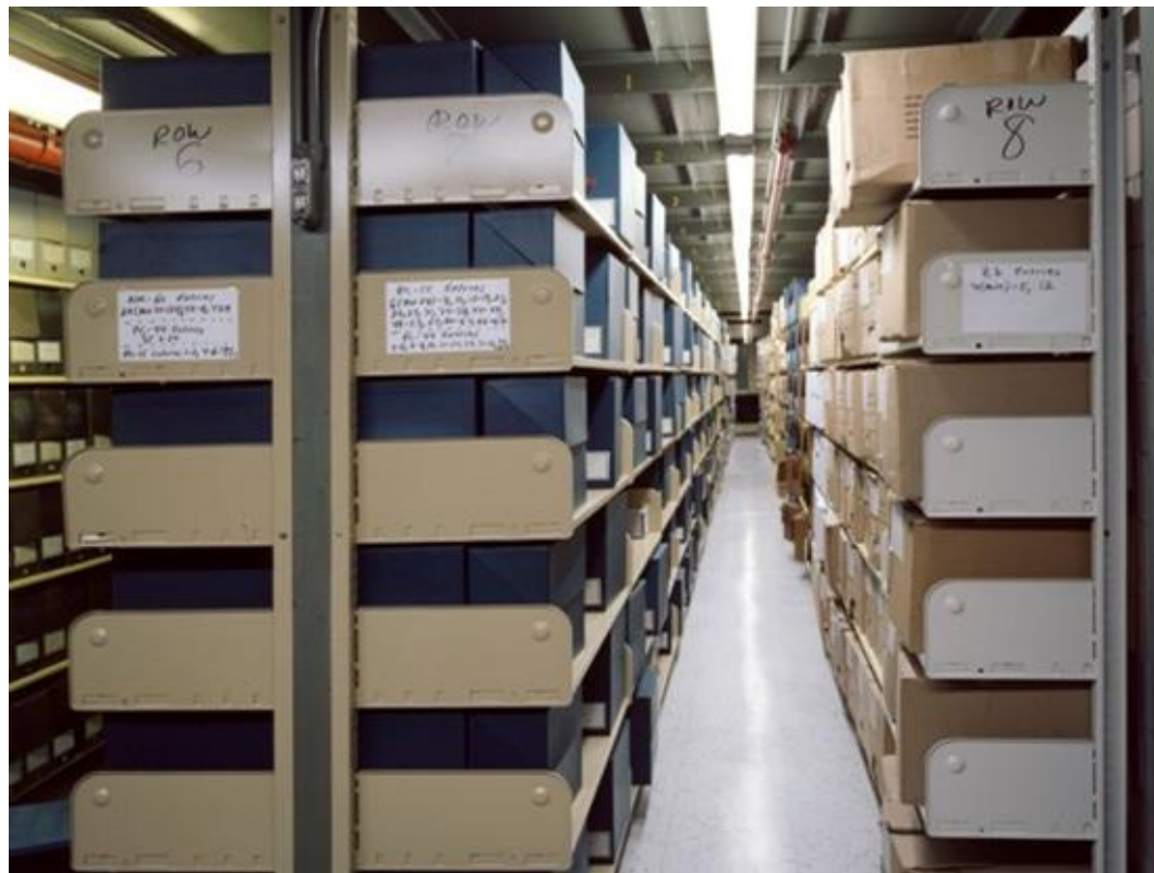
Stacks at the National Archives in Washington, DC