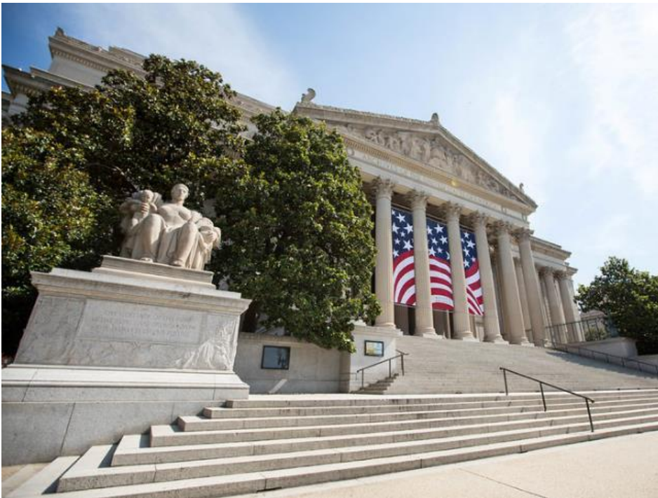
National Archives in Washington, DC