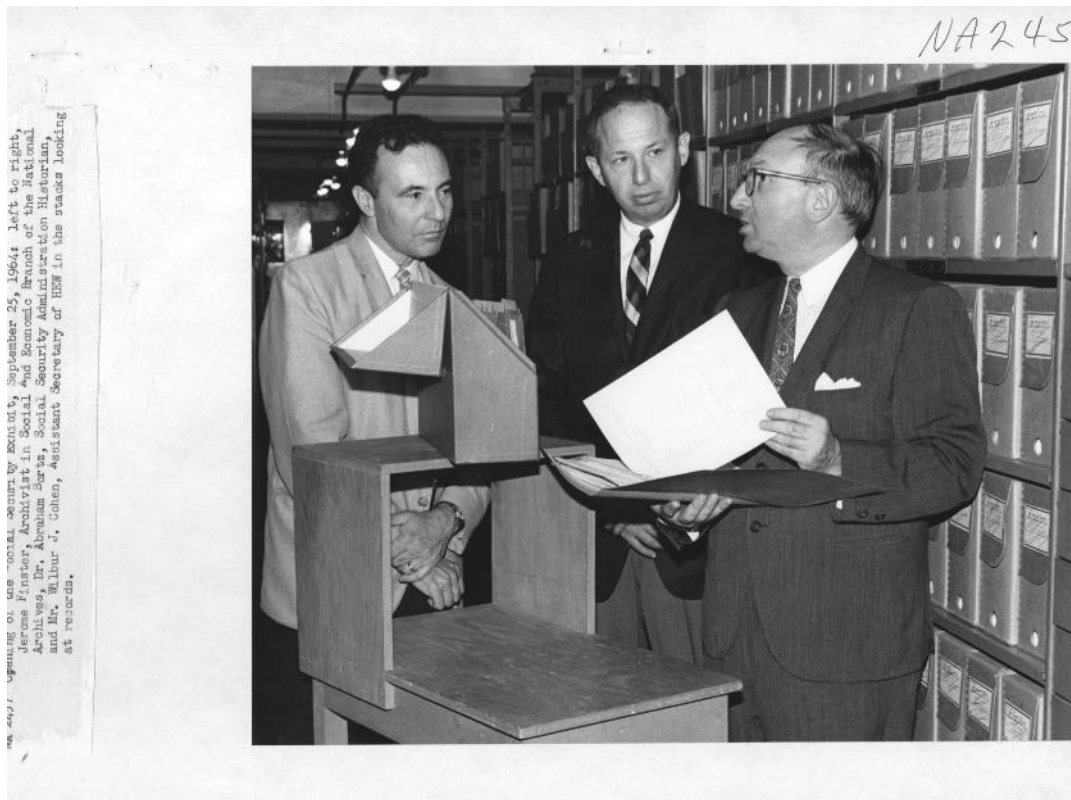
Photograph in the stacks at the opening of the Social Security exhibit at the National Archives, 9/25/1964