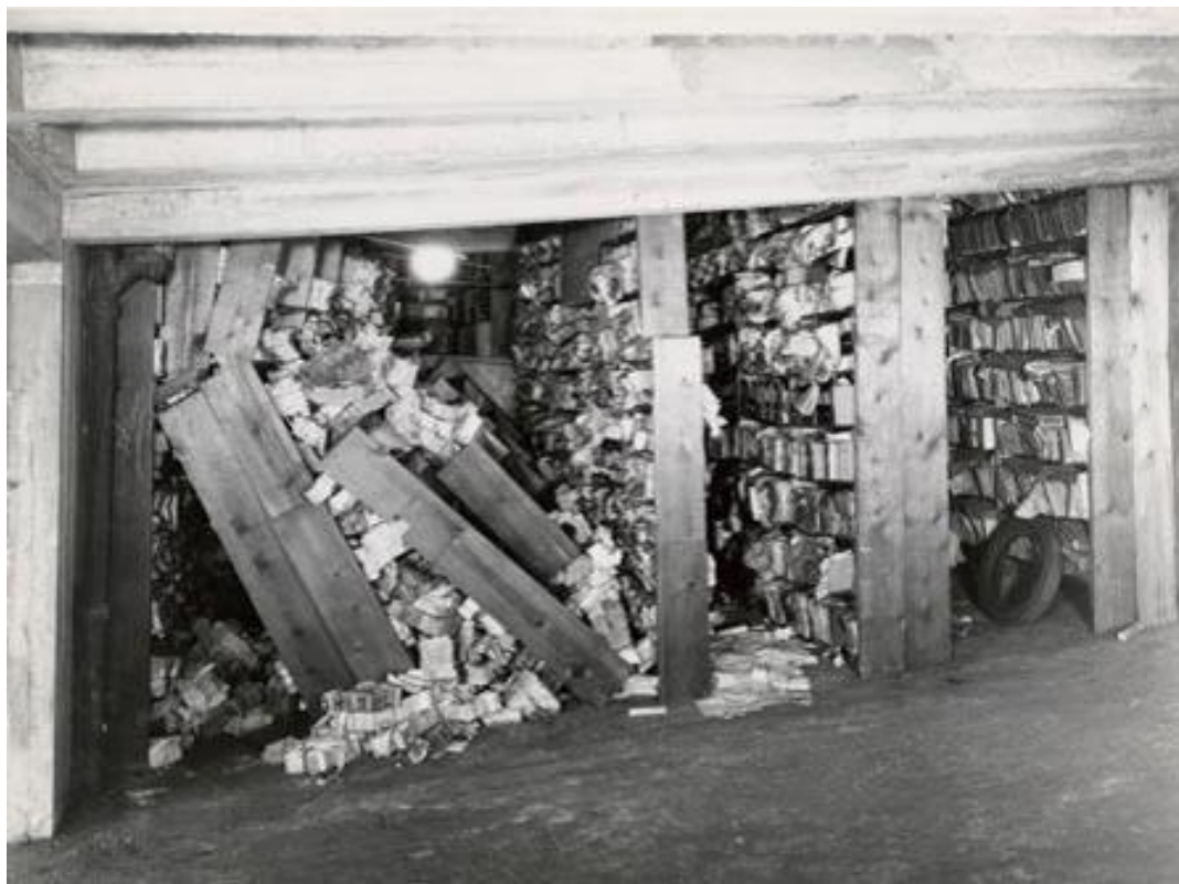
The condition of War Department records stored in the White House garage (1920s) illustrate the need for a National Archives.